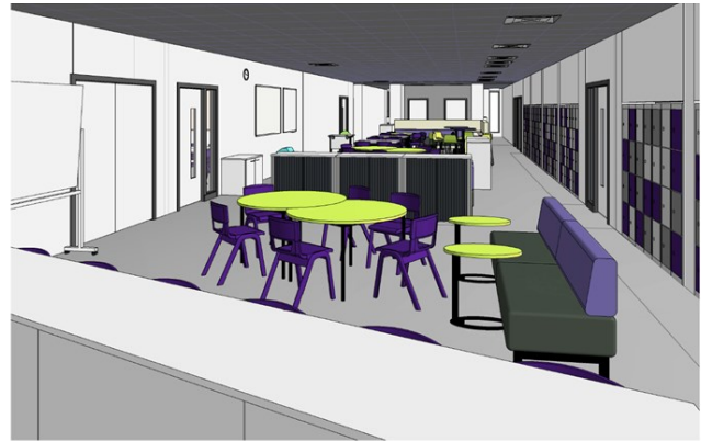
Home Base Area.