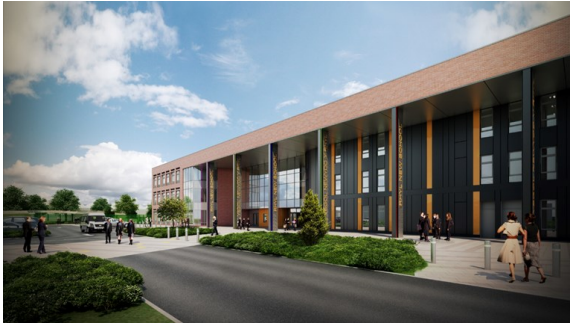
The front of the school